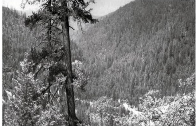
PHOTO CREDIT: George E. Gruell. 2001. Fire in Sierra Nevada Forests: A Photographic Interpretation of Ecological Change Since 1849 . Mountain Press.

Many complex factors influence forest health, making it hard to predict the long-term effects of climate change on headwater forests at a scale that is meaningful for management. However, climate scientists are confident that the headwater region will see more intense droughts and increased wildfire activity over time. In their current condition, some forests may not recover from these events and will transition to shrublands.