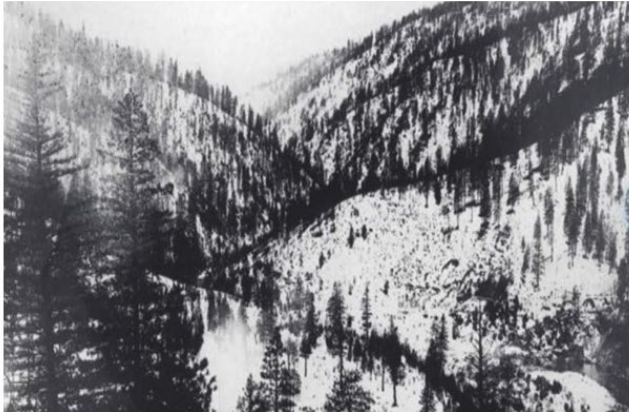
Feather River 1890