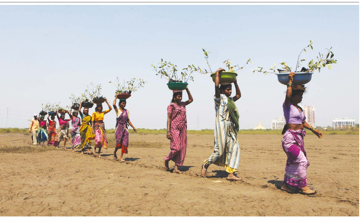
Women in northern Mumbai, India, have planted mangrove saplings to protect the area against rising sea levels.