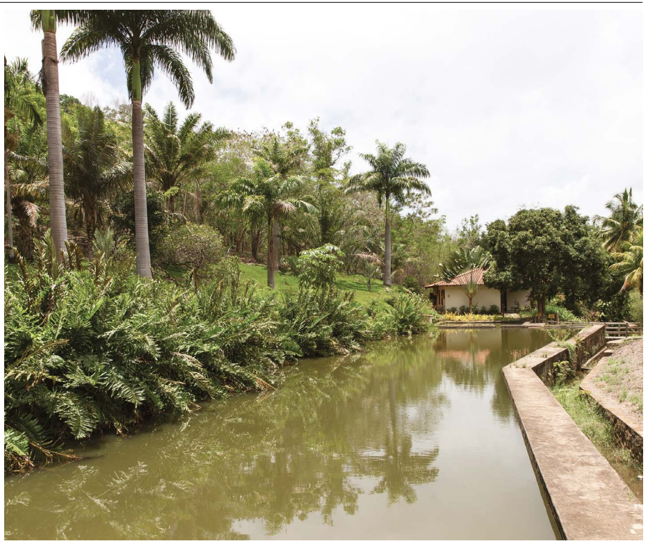
Instituto Terra, an initiative in Aimorés, Brazil, is restoring a devastated ecosystem.

Achieving these significant long-term benefits requires several things. Nature-based solutions of good quality must be scaled up rapidly – and not at the expense of other